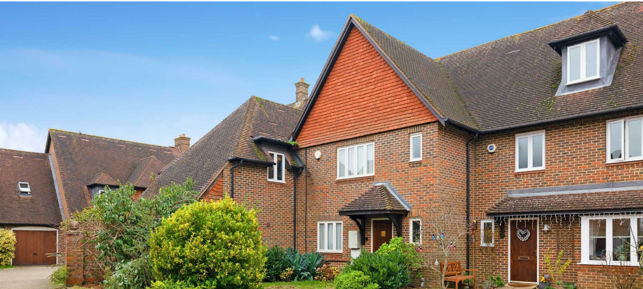
Tile Kiln, Ringmer